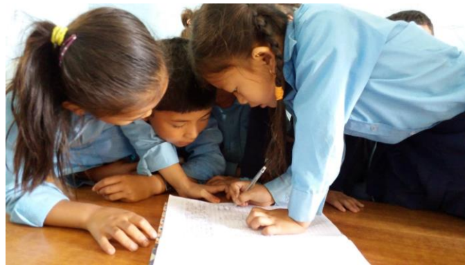
Children participating in winter camps