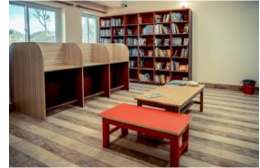
The refurbished library