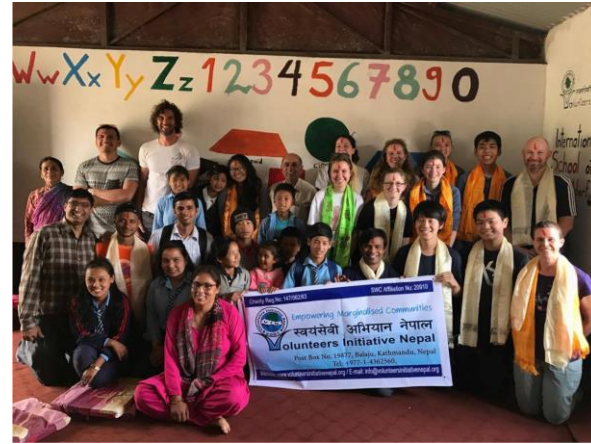
ISD students in one of the classrooms they painted

A big thanks to all the students who spent their Spring break to give Nepalese children a brighter learning environment.