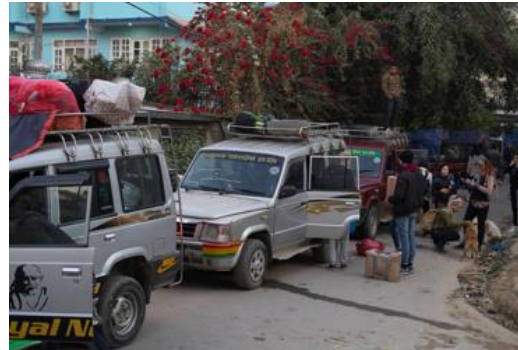
Packing the jeeps for the 10 hour journey