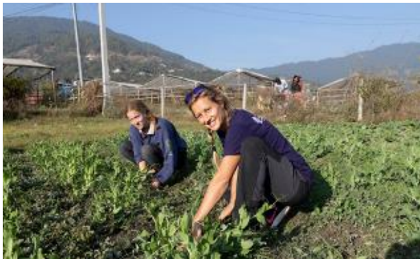
Volunteers on teaching farm

On the following pages, you will find an overview of VIN's various program activities in 2019. They cover all our project areas; Kavresthali, Okharpauwa, Okhaldhunga and even some projects conducted in Jitpurphedi.