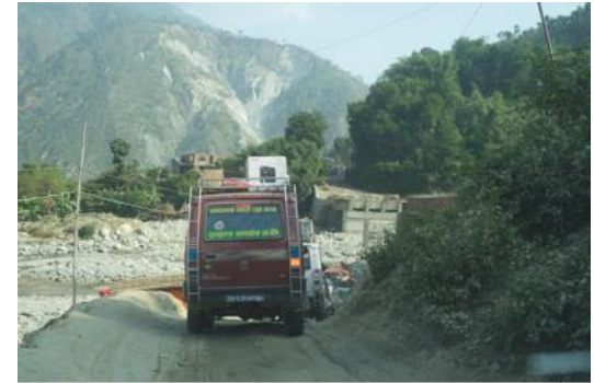
On our way to Okhaldhunga