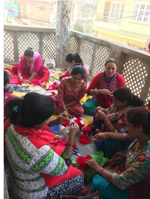
Women attending sewing class in Kavresthali May 2018.

The Women's Empowerment Program is essential for the social and economical development of the areas where our organization is working. The program has been implemented for 12 years in Jitpurphedi, three in Kavresthali and 11 in Okhaldhunga district. During this time, we have been working with and for the most marginalised women to improve their quality of life and uplift their social and economic status, through income generation activities, formal and informal education, and social awareness workshops. The goal of the program is to empower women socially and economically through education, life skills and income generation initiatives. This program aims at meeting three objectives, around which rotate the three main projects, active in four municipalities: Jitpurphedi, Kavresthali, Taluwa and Thulachhap.