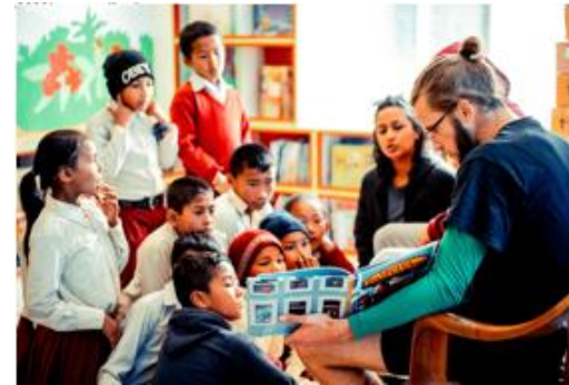
Story time in the children's center